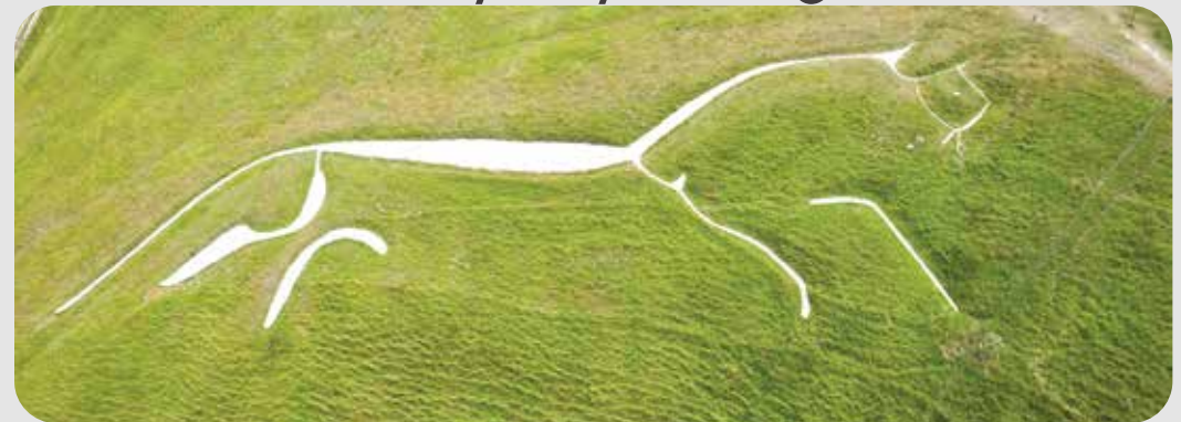
Without The Rush